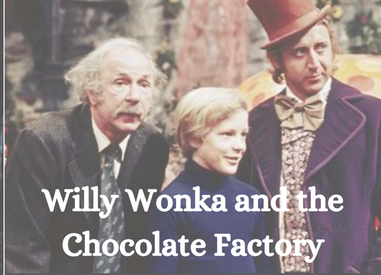
Willy Wonka and the Chocolate Factory