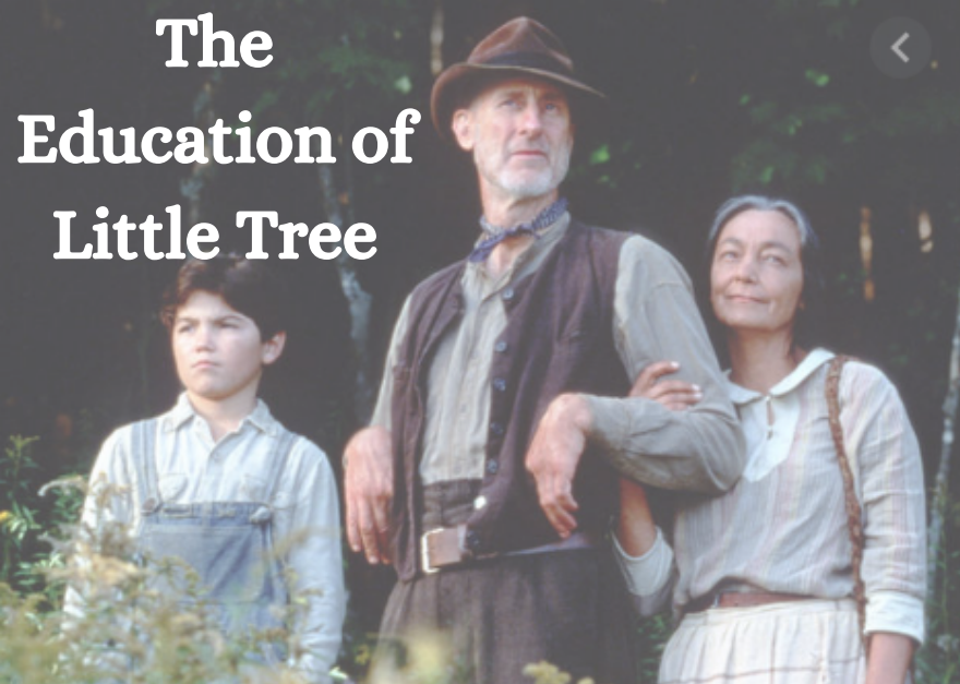
The Education of Little Tree